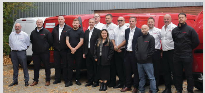
The LAUNCH team pictured left to right (Photo taken October 2025).

Marketing Email: marketing@launchtech.co.uk